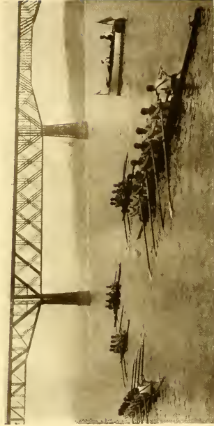
THE CREWS AT POUGHKEEPSIE